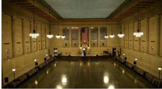
War Memorial Building